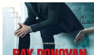
Ray Donovan: The First Season AUGUST 1, 2014