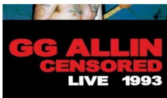
GG. Allin: (Un)Censored AUGUST 1, 2014

Read Next > B.B. King: The Life of Riley