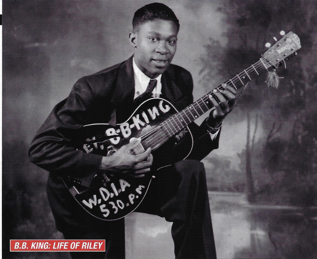
B.B. KING: LIFE OF RILEY

Me to the River , a feature documentary on the influences of the Memphis music scene. Email Ken Weinstein at Weinstein@BigHassle.com for further details and visit http://Bonnaroo.com/activities/cinema for the full cinema schedule.