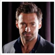
Hugh Jackman may be The Greatest Showman On Earth