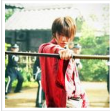
Rurouni Kenshin 2: Kyoto Inferno - New trailer