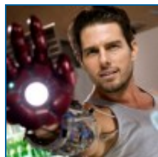
Stars Who Regret Turning Down Roles of a Lifetime