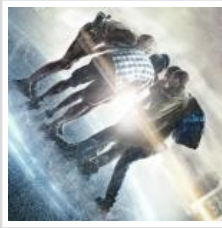
Project Almanac trailer is all about the time travel