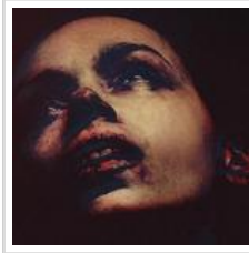
New posters for Starry Eyes