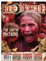
Rue Morgue Magazine - Issue #148 September 2014