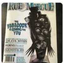
Rue Morgue Magazine - Issue #150 November 2014