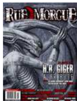
Rue Morgue Magazine - Issue #149 October 2014