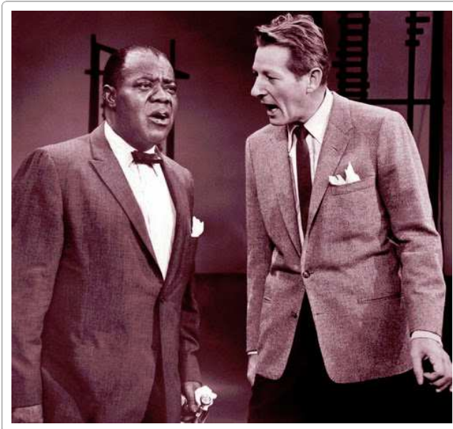
Any future Best of the Danny Kaye Show release would be wise to include a Louis Armstrong episode.

We're still a few weeks away from the release of The Best of The Danny Kaye Show DVD, featuring six terrific shows. But that's still not too early to begin planning for the next batch (assuming sales of the first set are strong, along the lines of the two Christmas shows released two years ago).