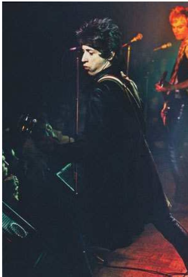
The Heartbreakers – Le Bataclan, Paris 1977.

What’s your opinion on “Born To Lose: The Last Rock”“n’ Roll Movie”? What about “Mona Et Moi”?