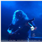
OPETH (Live) Samfundet, Trondheim, Norway