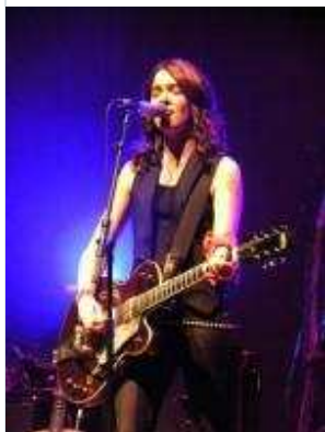
Brandi Carlile at the O'Shaughnessy