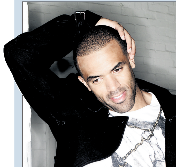
CRAIG DAVID: Bullied at school