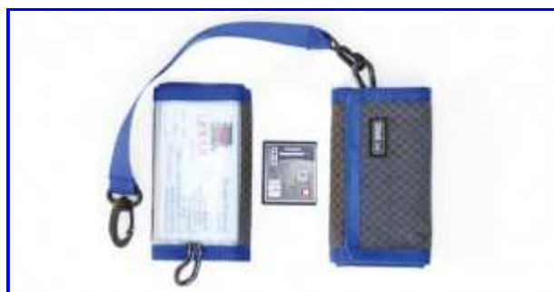
Pixel Pocket Rocket (Folded View)

If you are like most of the photographers that I know, you are probably always wondering how you can best care for your memory cards, business cards and some of those other small accessories that you wander around with in the field. With that being said, those fine folks over at Think Tank Photo have offered up a handy little wallet type folding holder that they call the Pixel Pocket Rocket. Here are a couple of photos of the thing and as you see it looks rather nice when folded up as well as being rather spacious for the cards when you open it up to see how they are stored.