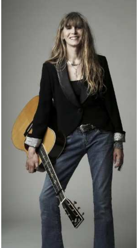
Rory Block.