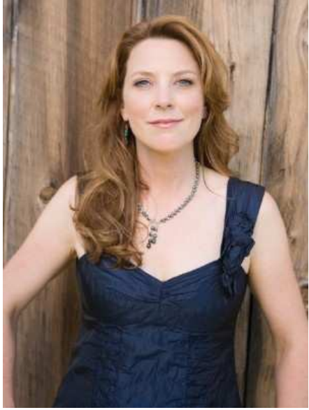
Susan Tedeschi.