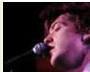
Okkervil River [Crystal Ballroom; Portland, OR] by David Harris