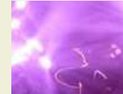
My Bloody Valentine [Aragon Ballroom; Chicago, IL]