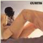
Curtis Mayfield Curtis