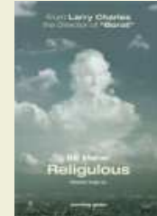
Religulous Dir. Larry Charles