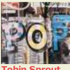
Tobin Sprout Carnival Boy by Tamec