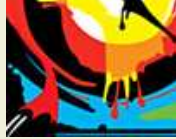
All Tomorrow's Parties New York 2008 [Monticello, New York; Kutsher's Country Club]