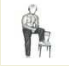
Deerhoof Offend Maggie