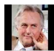
Richard Dawkins, the evolutionary biologist and "God Delusion" polemicist, recently offered a frightening glimpse of what might be called the reverse-fundamentalist worldview.