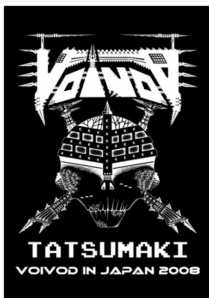
Voivod - Tatsumaki - Voivod Japan 2008 (MVD Visual)