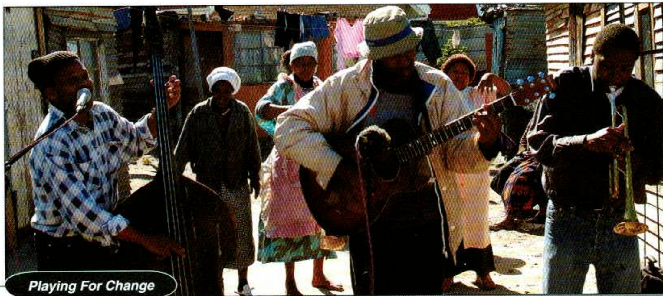
Playing For Change

The folks at Alfred Music Publishing have announced that their popular Singer's Library of Musical Theatre songbooks are now available packaged with CDs of piano accompaniment tracks that match the dozens of sheet music arrangements within each volume. This new feature allows vocalists to practice or perform the songs anywhere, regardless of the availability of a pianist. Recorded by professional pianists from New York's theater community, the accompaniment tracks on two audio CDs per volume precisely match the sheet music in their correlated songbook. Singer's Library of Musical Theatre songbooks are available at music retailers or online at alfred.com .