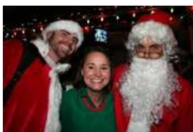
10 Things Under $10: Santarchy, Joe Strummer, and More