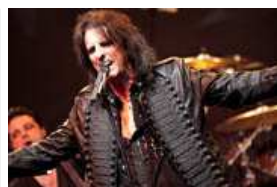
Concert Review: Alice Cooper's Christmas Pudding