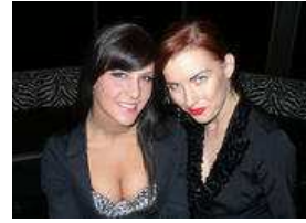
Whisper Lounge in Photos