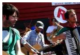
9-Piece Orchestral Punk Ensemble Coming To Rogue Bar