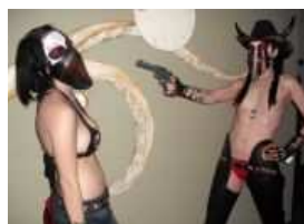
Winter Horrorland Fashion Show In Photos