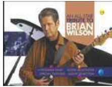
Brian Wilson: An All Star Tribute To