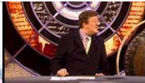
QI : Series B