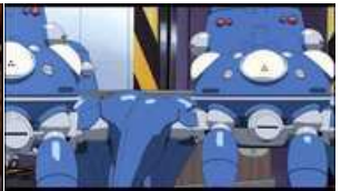
Ghost In The Shell: Stand Alone Complex - The Laughing Man