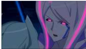
Witchblade: Volume 2