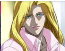
Yugo The Negotiator: Vol.4 - Russia 2 - Rebirth