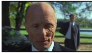
A History Of Violence