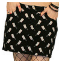
Sourpuss Cleaver Skirt