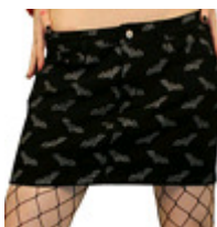
Sourpuss Bat Skirt