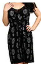
Sourpuss Muerte Skull Dress