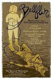
We Done Got Down Again. 4/2/2011