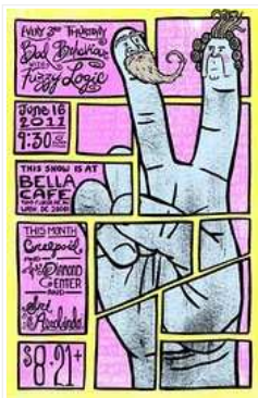
Bad Behaviour #2 with Fuzzy Logic & Friends @ Bella 6/16/2011