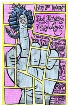
The First Bad Behaviour 5/19/2011