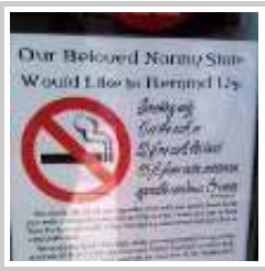
Borderlands Owner Expresses Bitterness Over "Nanny State"