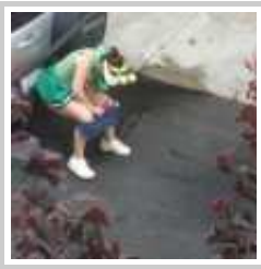
Should You Hide Alcohol on Your Body at Bay to