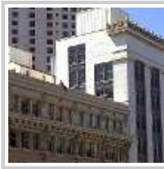
Suicide Jumper at 3rd & Market [Updated] (SFist)