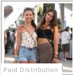
Coachella Street Style