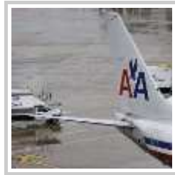
Guy Goes Nuts Aboard SFO-Bound Flight Gets Taken