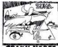
100 Greatest Guitar Solos: 39) "Cortez the Killer" (Neil Young)