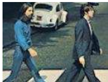
The Beatles "Here Comes the Sun" Video Lesson