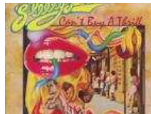
100 Greatest Guitar Solos: 40) "Reelin' in the Years" (Elliot Randall)