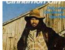
How to Play Neil Young's "Cinnamon Girl" [Video]