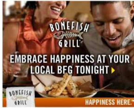
BoneFishGrill.com Ads by Google

Disagree? You can post your thoughts about this review on the DVD Talk forums. Agree?