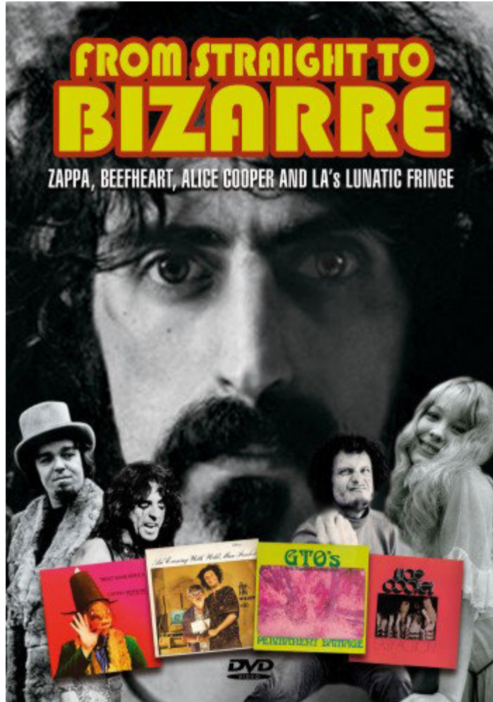
From Straight to Bizarre: Zappa, Beefheart, Alice Cooper and L.A.'s Lunatic Fringe 161 minutes A Sexy Intellectual Production