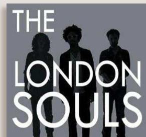
The London Souls The London Souls EMI