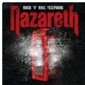
Music Review: Nazareth – Rock 'n' Roll Telephone