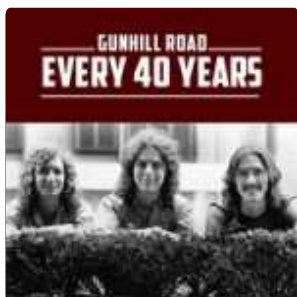
CD Review – Gunhill Road: Every 40 Years