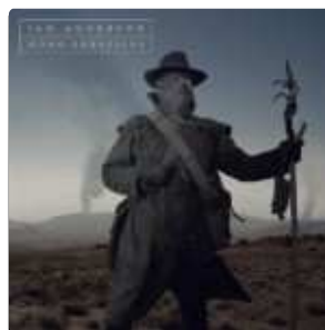
CD Review: Ian Anderson – Homo Erraticus

You need to accept third-party cookies in your browser in order to comment using this social plugin.