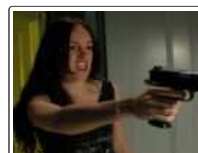
Nun Of That