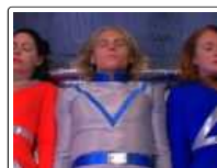
Atomic Brain Invasion