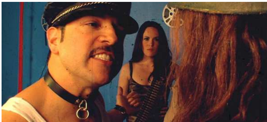
2010 The Disco Exorcist