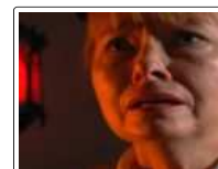
Beyond The Dunwich Horror