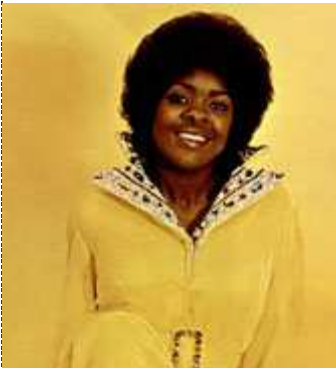
The Peptides Bring Malt Shop Nostalgia to Disco Classic (Cover Me Premiere)

Dirty Projectors Oooh and Aaah Through More Dylan