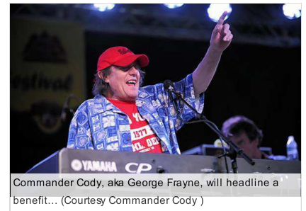
Commander Cody, aka George Frayne, will headline a benefit...

"The exact same amount of money that used to get you eight hippies, a giant bus, four roadies, two secretaries, one sleazy manager and a lawyer on retainer now gets you four old guys in a minivan," Frayne said by phone from his New York home. "The good news is that the four old guys are really good."