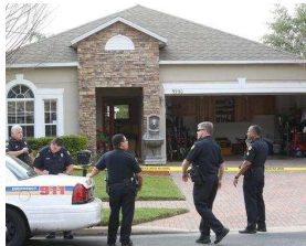
No charges for teen who accidentally shot, killed 12-year-old brother, police say