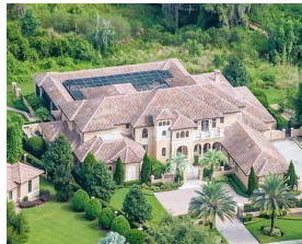
Auction set for Warren Sapp's Windermere home