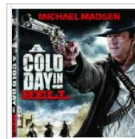
Film Review: A Cold Day in Hell (2011)