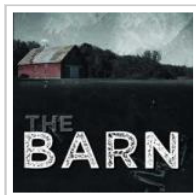
Film Review: The Barn (short film) (2011)