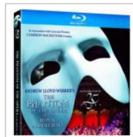
The Phantom of the Opera - Giveaway!