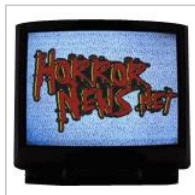
'FRANKENWEENIE' Rises from the Grave, Again?