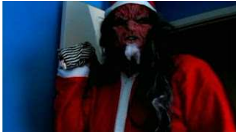
Tale #4: Lepus