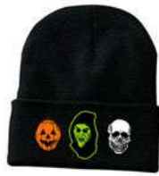
Halloween III: Season of the Witch Beanie