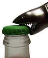
Jaws Stainless Steel Bottle Opener