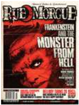
Rue Morgue Magazine - Issue #142 Febuary 2014