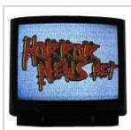
Trailer: The Avengers (2012) - Superbowl Spot