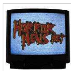
Trailer: The Avengers (2012) German Trailer