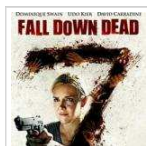
Film Review: Fall Down Dead (2007)