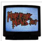
Trailer: Domsday Book (2012) English-sub