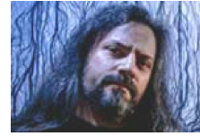
Gorguts Are Back to Gore Again