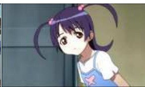
Witchblade: Volume 2