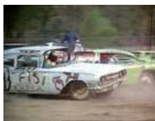
Grand Theft Auto

About This Site Meet the Team Advertise With Us Contact Us Advertising Policy Privacy Policy