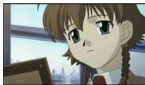
Madlax: Vol.1 - Connections