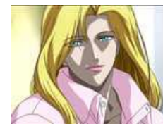
Yugo The Negotiator: Vol.4 - Russia 2 - Rebirth