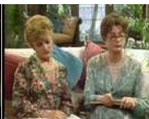
Dear Ladies: Series 1