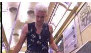
Buffy The Vampire Slayer: Season 7 Boxset