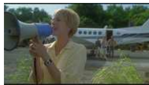
Jurassic Park III