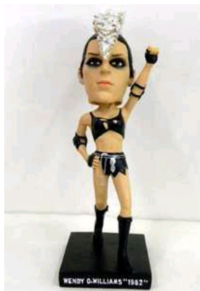
PUNK PRINCESS Wendy O. Williams has been commemorated with her very own “Throttlehead” doll. She is the sixth punk rocker to be immortalized this way by Aggronautix.

Williams is the sixth punk personality to get the Throttlehead treatment. In May 2009, the company launched the series with a popular GG Allin “1991” figure, which was limited to 2,000 numbered units and has sold out. Another sell-out: the 500-figure run of the GG Allin Extra Filthy Boody Edition “with added crud, blood and cuts;” Dwarves Double Throttlehead (1,000 units) featuring Blag The Ripper and HeWhoCanNotBeNamed; Tesco Vee of the Meatmen (1,000 units), captured in ABBA clogs and giving viewers a single-fingered salute; and The Descendents’ frontman Milo (1,000 units) in 2009. A 1,000-run limited-edition Throttlehead for D.O.A.’s Joe Shithead Keithley was released in 2010.