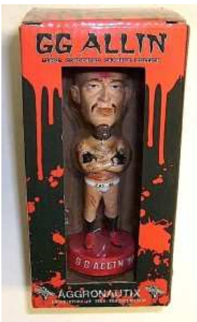
Bonus Show # 1 (Under The Rail, Seattle, May 26, 1993):

Shot out in the once-picturesque Pacific Northwest, a mere month before the man’s most messy passing on 6/28/93, and featuring his crack back-up band of Murder Junkies to boot, allow me to run GG’s action down thumbnail-style: