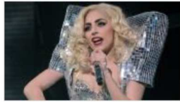
Backstage Pass: Glenn Gamboa's music blog