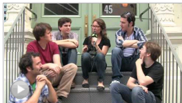
LWMB Interviews Rotary Downs