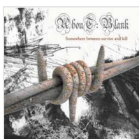
ABOUT: BLANK Somewhere Between Survive And Kill