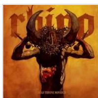
RHINO Dead Throne Monarch