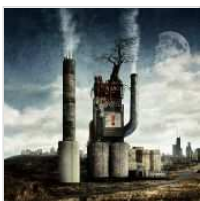
ENOCHIAN THEORY Evolution: Creatio Ex Nihilio