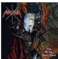
SKELATOR Time of the Sword Rulers