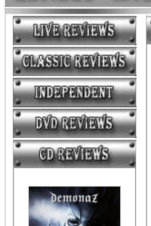
DEMONAZ March Of The Norse

REVIEWS - INTERVIEWS - NEWS - PICTURES - RADIO - LINKS - THE CREW - ABOUT