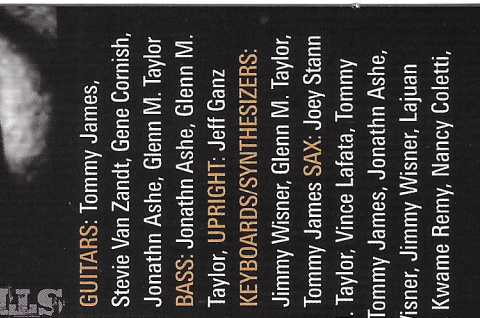
STEVIE VAN ZANDT