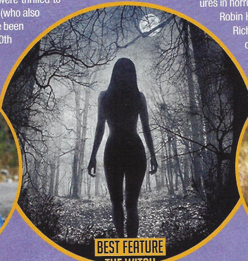
BEST FEATURE THE WITCH