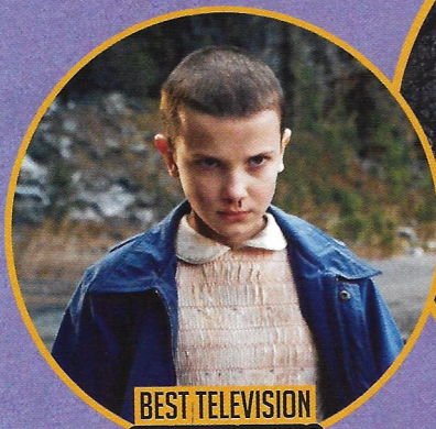
BEST TELEVISION STRANGER THINGS