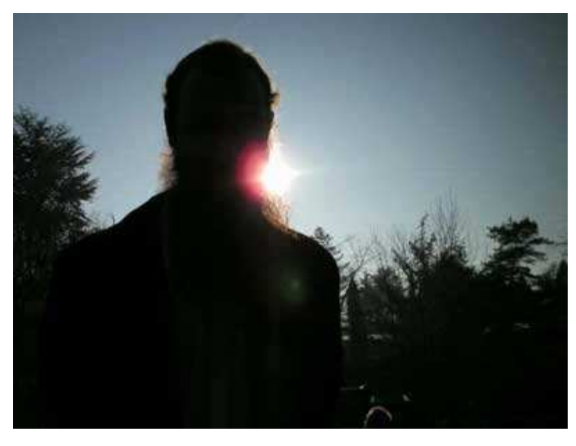
I enjoyed the journey and liked the relationship on screen of the characters. Powerful and subtle all combined ....Silence, ca tue! is a cool release!