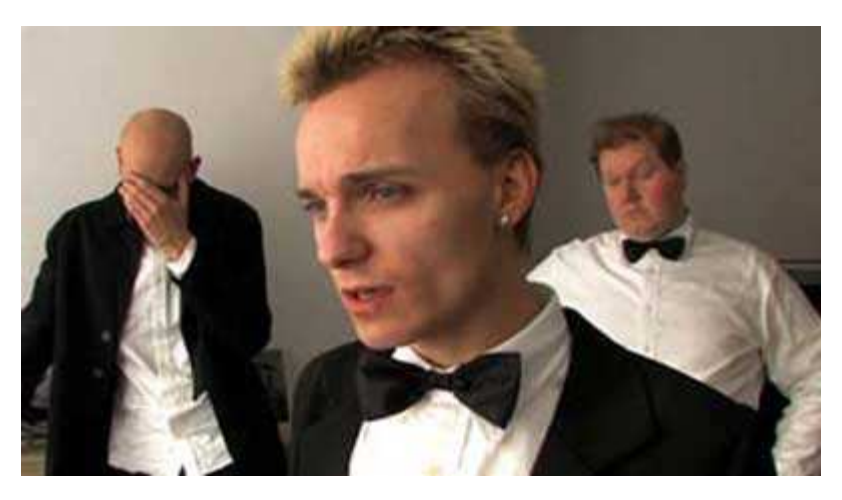
At morning they continue as planned and approach the film producer at his apartment. Though not before stopping off at a local gun shop and persuading the owner to sell them a under the counter pistol off the black market.