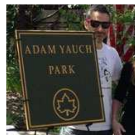
Adam Yauch Park officially open in Brooklyn Heights