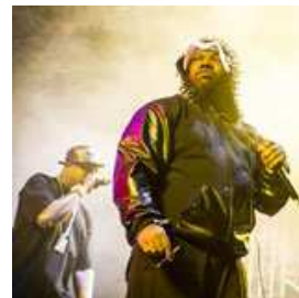
Coachella Weekend 2 Day 3 in pics (Ghost BC, The Three O'Clock, DIIV, Thee Oh Sees, Nick Cave, Grimes & more)