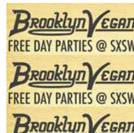
BrooklynVegan SXSW Day Parties: Wed.-Sat. (lineups & RSVP)