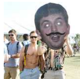
Coachella Day 3 Photos (Wu-Tang Clan, Vampire Weekend, Father John Misty, Grimes, Kurt Vile, James Blake ++ more)