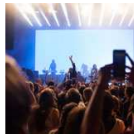
Phoenix played The Apollo with Blood Orange (pics, setlist)