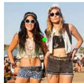
Coachella webcast livestreaming at YouTube (schedule)