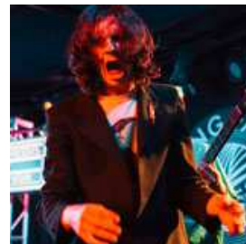
Foxygen, Amen Dunes, LODRO & Prince Rupert's Drops played first BV-curated RBSS show at the Knit (pics)