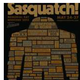
Sasquatch! Music Festival 2013 lineup is here