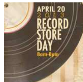
a guide to Record Store Day 2013

don't give a F what you think. if i'm a troll, i hope me and everyone i love drops dead this instant.