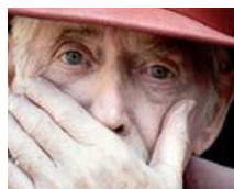
Billionaire Tells Americans to Prepare For "Financial Ruin"