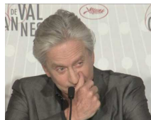
Michael Douglas cries