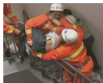
Suicide jumper caught mid-air