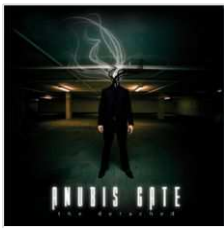
ANUBIS GATE The Detached