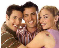
20 Terrible TV Spin-offs (That Were Cancelled In Under A Minute) Styleblazer