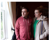
New! Soap Scoop: Corrie, EastEnders, Emmerdale,