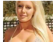
15 Celebs Who Are Not Aging Very Nicely Madame Noire