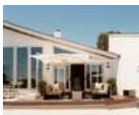
How To Have An Outdoor Space Your Neighbors