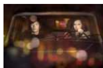
Tomorrow's World in conversation with Best Fit