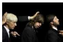
Liars perform new cut 'Mess on a Mission' for Pitchfork

← Mark Lanegan & Duke Garwood – Black Pudding