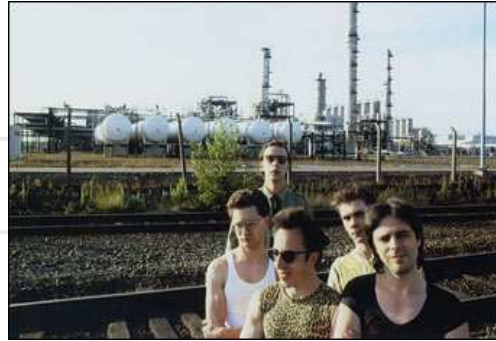
Young Galaxy: Relaps compiles rare material and explores the history of Univers.

Add a Comment (Link will open a popup window)